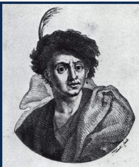
Cosmas Damian Asam