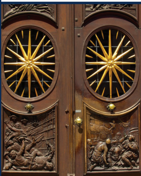
Church Front Door